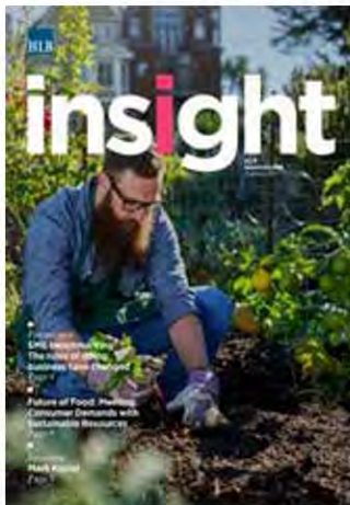
Insight Autumn 2017

What's happening in the network New HLB members; Anniversaries