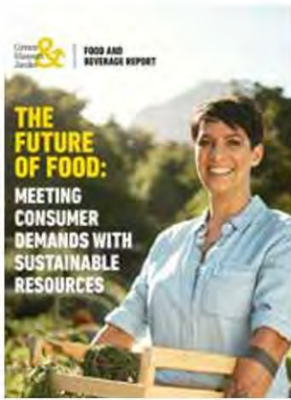
Perspective: Green Hasson Janks Page 9