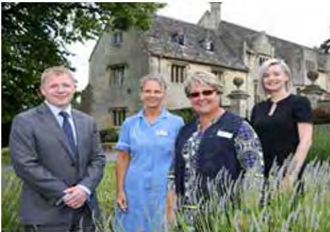
Initiatives: Hazlewoods Page 16